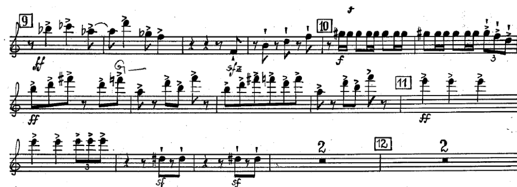
Figure 9 to 12