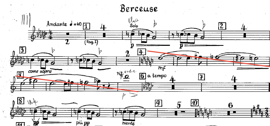
Figure 1 to 4, 8 to 9